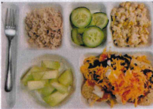
Amazing School Lunch!

Be Responsible Be Respectful Be Safe Be a Problem Solver