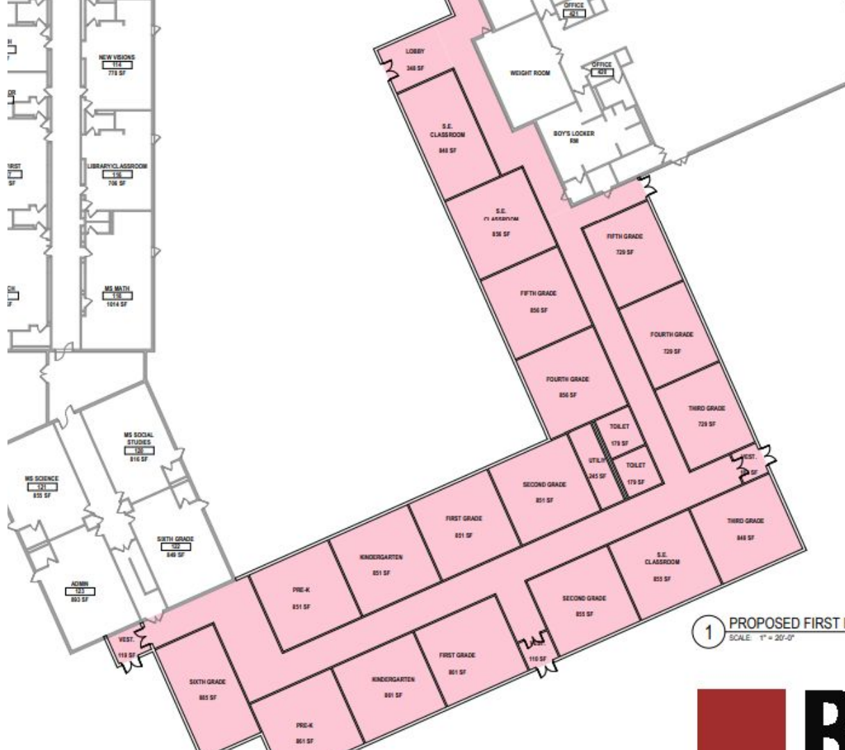
1 PROPOSED FIRST F SCALE: 1" = 20'-0"